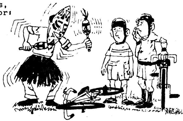
"Are you sure this is an authorized repair shop?"